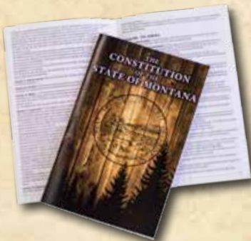
Free Constitution Project