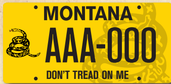
Gadsden Flag License Plate