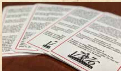
Bill of Rights Hard Card