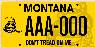
Gadsden Flag License Plate