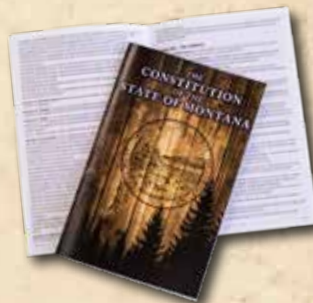
Free Constitution Project