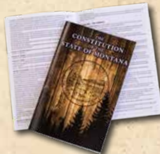
Free Constitution Project