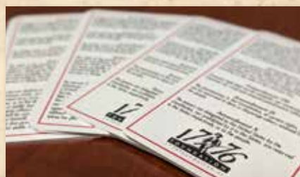
Bill of Rights Hard Card